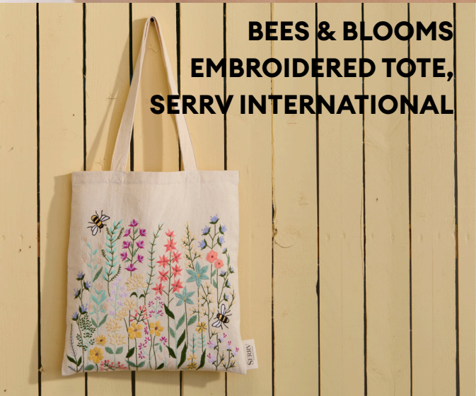
BEES & BLOOMS EMBROIDERED TOTE, SERRY INTERNATIONAL