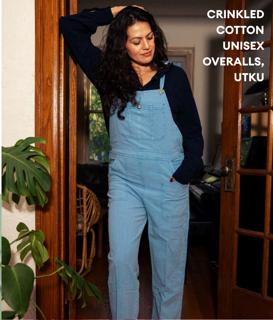
CRINKLED COTTON UNISEX OVERALLS, UTKU