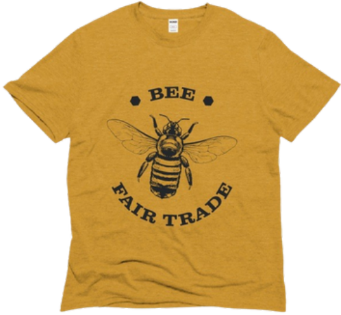
BEE FAIR TRADE TSHIRT, THE GREEN SHEPHERDESS