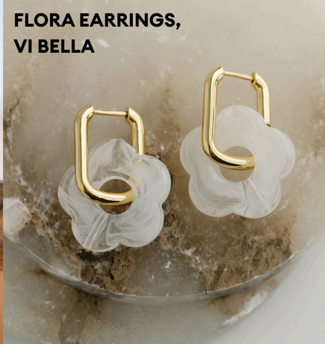
FLORA EARRINGS, VI BELLA