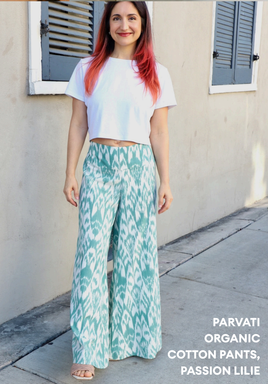
PARVATI ORGANIC COTTON PANTS, PASSION LILIE