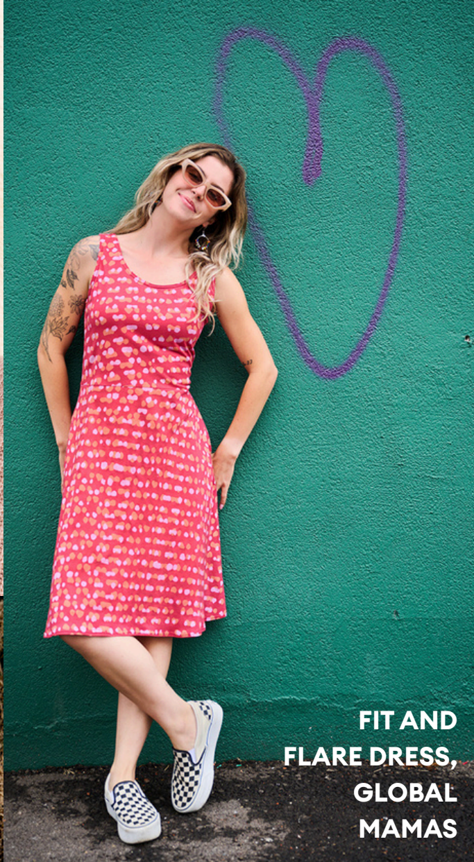
FIT AND FLARE DRESS, GLOBAL MAMAS