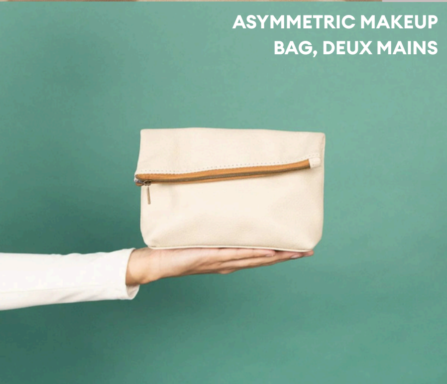
ASYMMETRIC MAKEUP BAG, DEUX MAINS