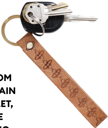
BLOSSOM KEYCHAIN WRISTLET, JUBILEE TRADING COMPANY