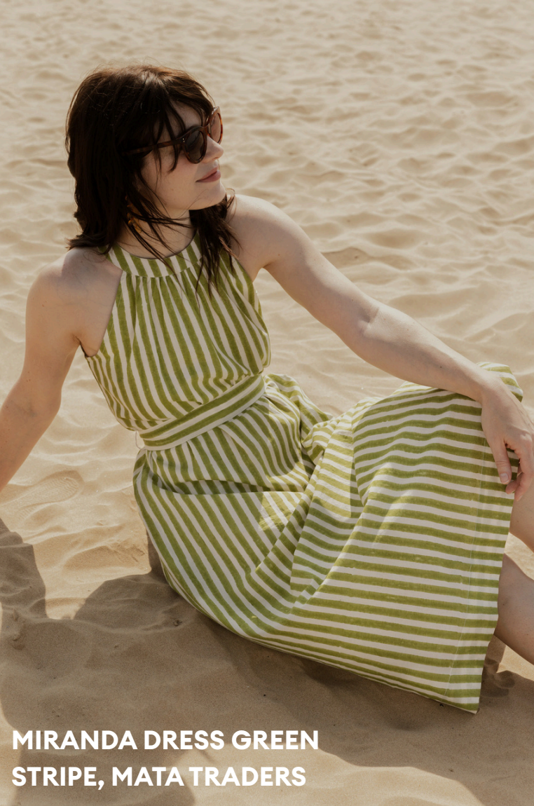
MIRANDA DRESS GREEN STRIPE, MATA TRADERS