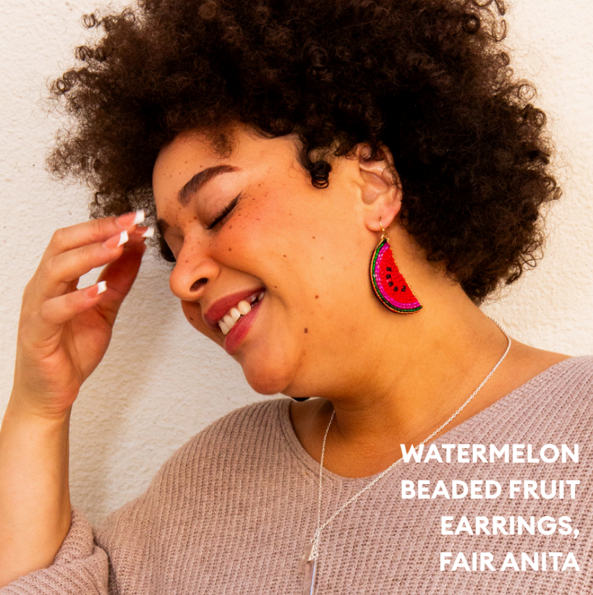
WATERMELON BEADED FRUIT EARRINGS, FAIR ANITA