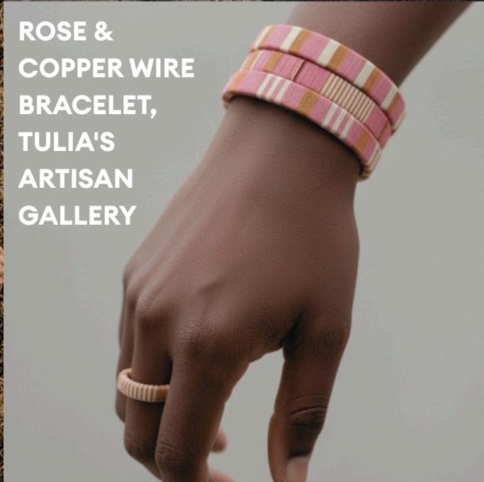
ROSE & COPPER WIRE BRACELET, TULIA'S ARTISAN GALLERY