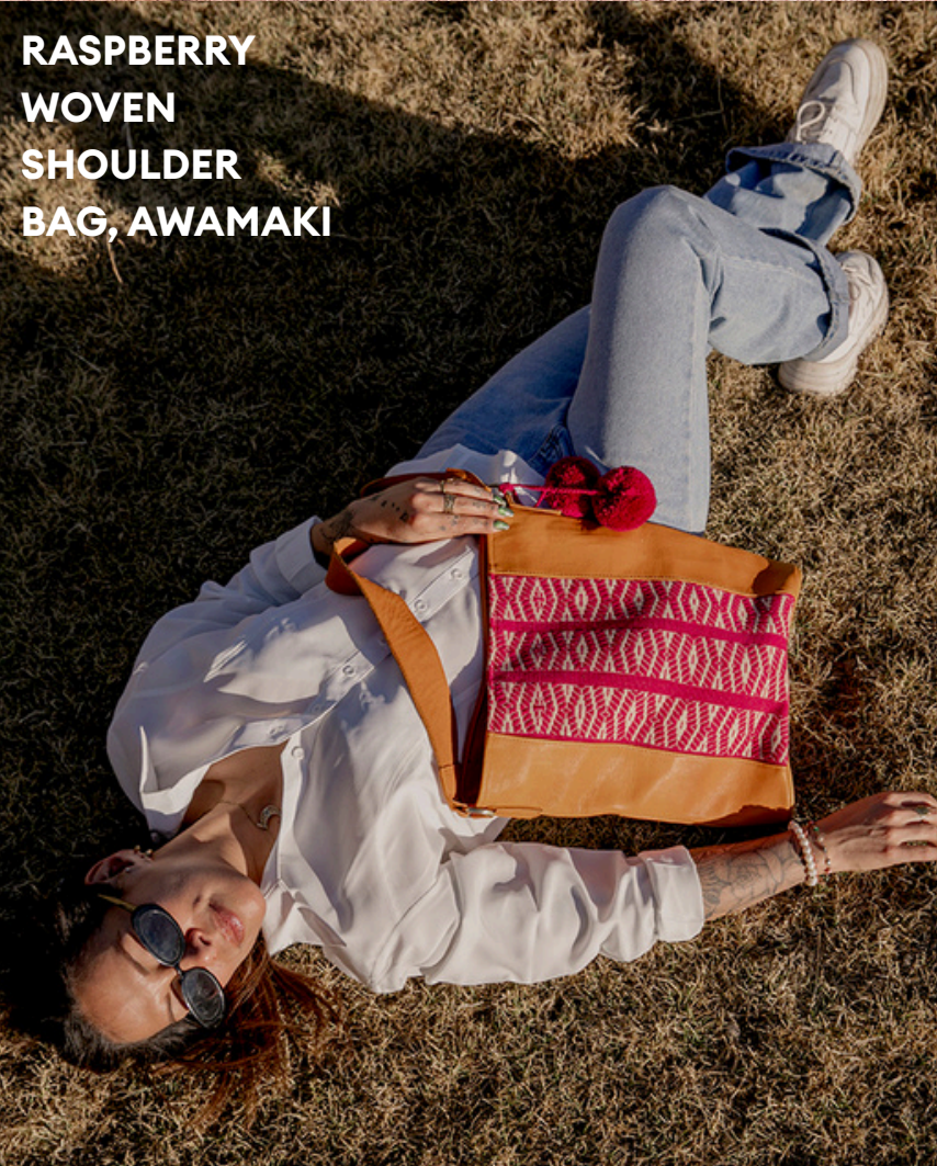
RASPBERRY WOVEN SHOULDER BAG, AWAMAKI