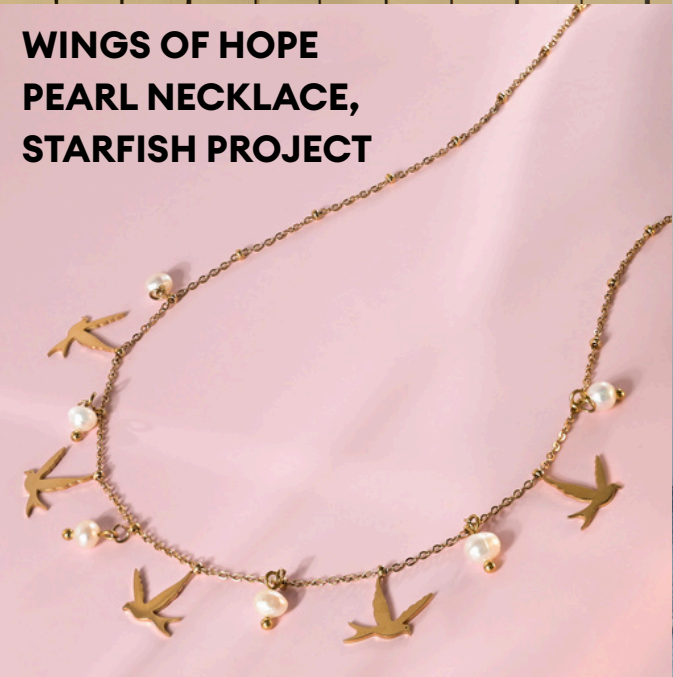
WINGS OF HOPE PEARL NECKLACE, STARFISH PROJECT