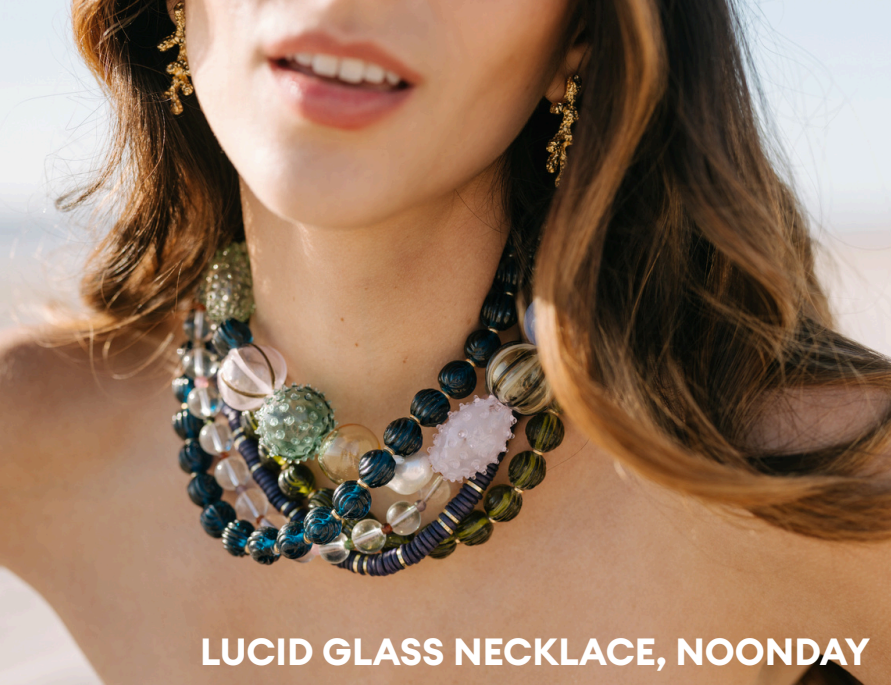
LUCID GLASS NECKLACE, NOONDAY