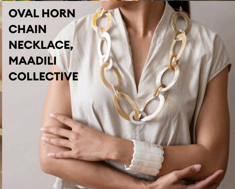
OVAL HORN CHAIN NECKLACE, MAADILI COLLECTIVE