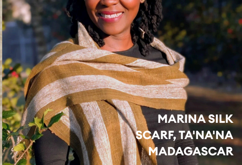
MARINA SILK SCARF, TA'NA'NA MADAGASCAR